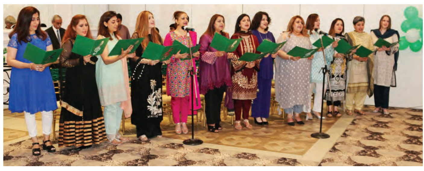
"Staff appreciation dinner was a beautiful evening that reunited the ISC-Lahore family to rejoice together once again. It stirred the confidence and motivation in us to welcome new challenges and to aim for better future."